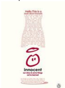
A Book About Innocent: Our Story and Some Things We've Learned