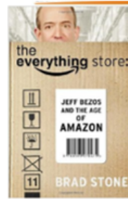
The Everything Store: Jeff Bezos and the Age of Amazon