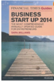
The Financial Times Guide to Business Start Up 2014: The Most Comprehensive Annually Updated Guide for Entrepreneurs